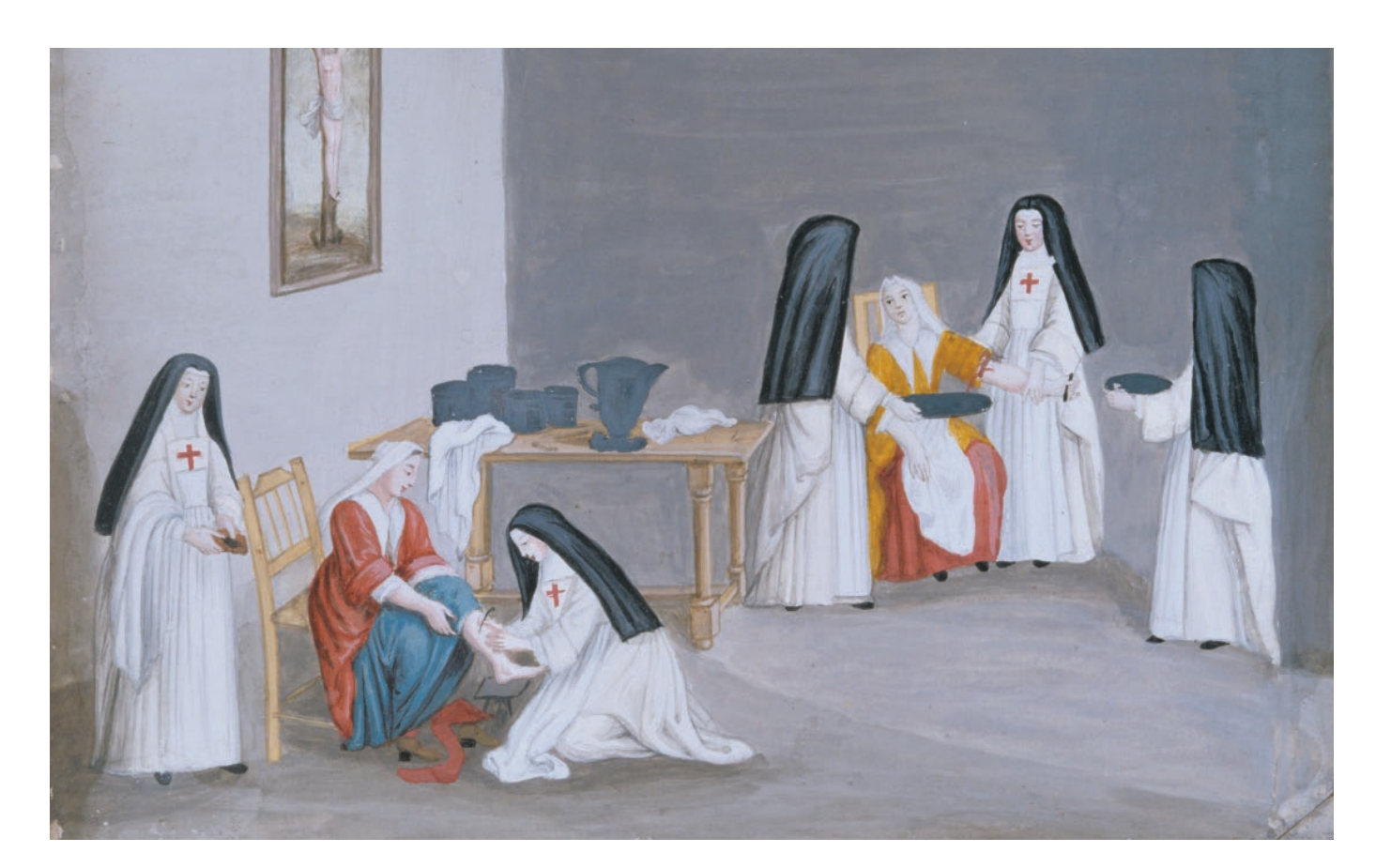
FIGURE 2.6 This was painted by an unknown painter around 1710. It shows nuns caring for the sick in an abbey. Analyze: What does this painting tell you about healthcare in the early 1700s?