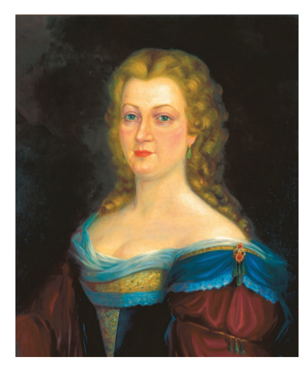
FIGURE 2.8 This reproduction of a portrait of Marie-Charlotte Denys de la Ronde was painted by Saint-Marc Moutillet in the 1950s. Analyze: Judging by the details in the painting, was Denys de la Ronde a habitant or a noble?

FIGURE 2.7 Kalm wrote this observation during a 1749 visit to New France. Analyze: What does Kalm's observation say about the role of women in New France?