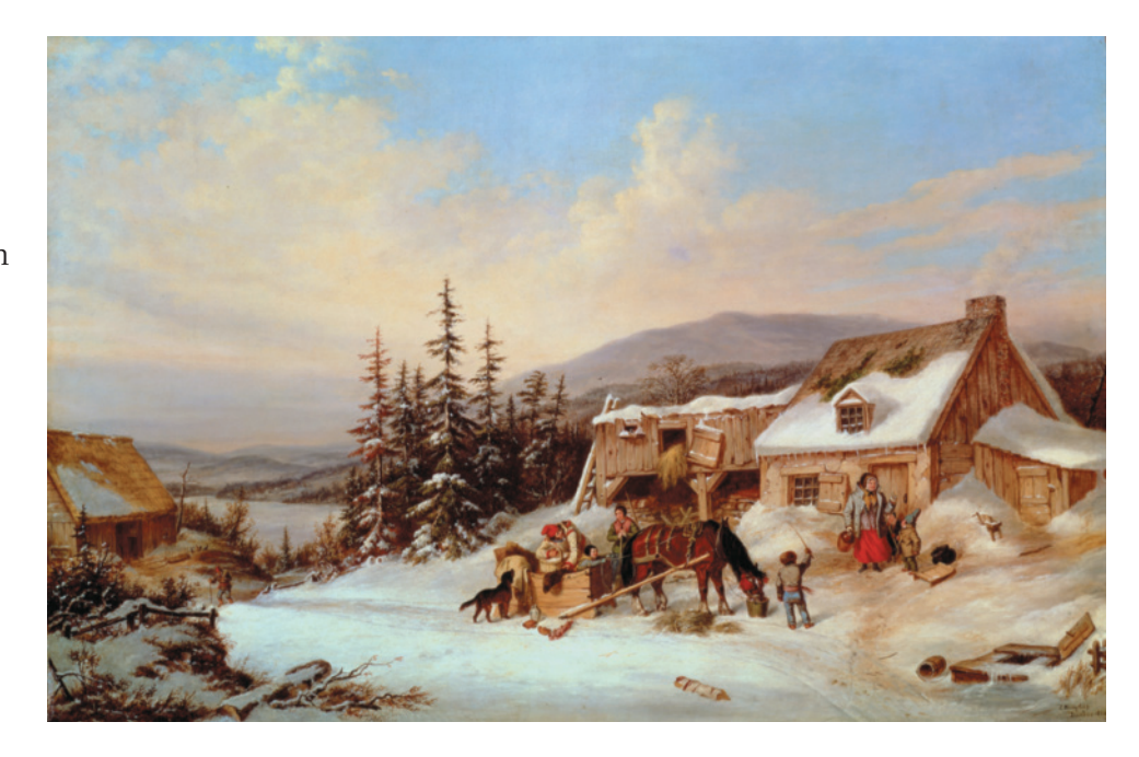
FIGURE 2.1 Cornelius Krieghoff painted The Habitant Farm in 1856. Habitants built their homes with steep roofs so that the heavy snows would slide off. Analyze: What other adaptations to the environment can you spot in this painting?

habitant French settler who farmed a small plot of land in what is now Québec