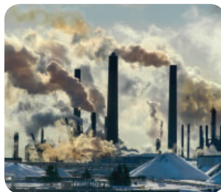
Figure 3 Human activity has an impact on the health of fluids.