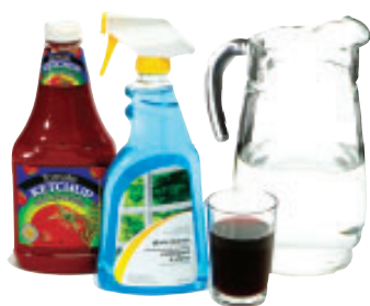
Figure 1 All homes contain many different fluids.

fluids: materials that have no fixed shape and are free to flow, such as liquids and gases