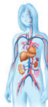
Figure 4 Blood travels throughout the human body via arteries (red) and veins (blue).