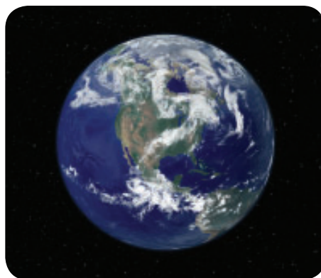
Figure 2 Two fluids essential for life—water and air—cover and surround our planet.

We live in a world full of fluids, but not all fluids are liquids. Fluids are substances that flow, so gases are fluids, too. The atmosphere that surrounds Earth (Figure 2) is a fluid that is crucial to all life forms on the planet. Unfortunately, we harm the atmosphere when we release dangerous gases into the air from cars, factories, and landfill sites (Figure 3).