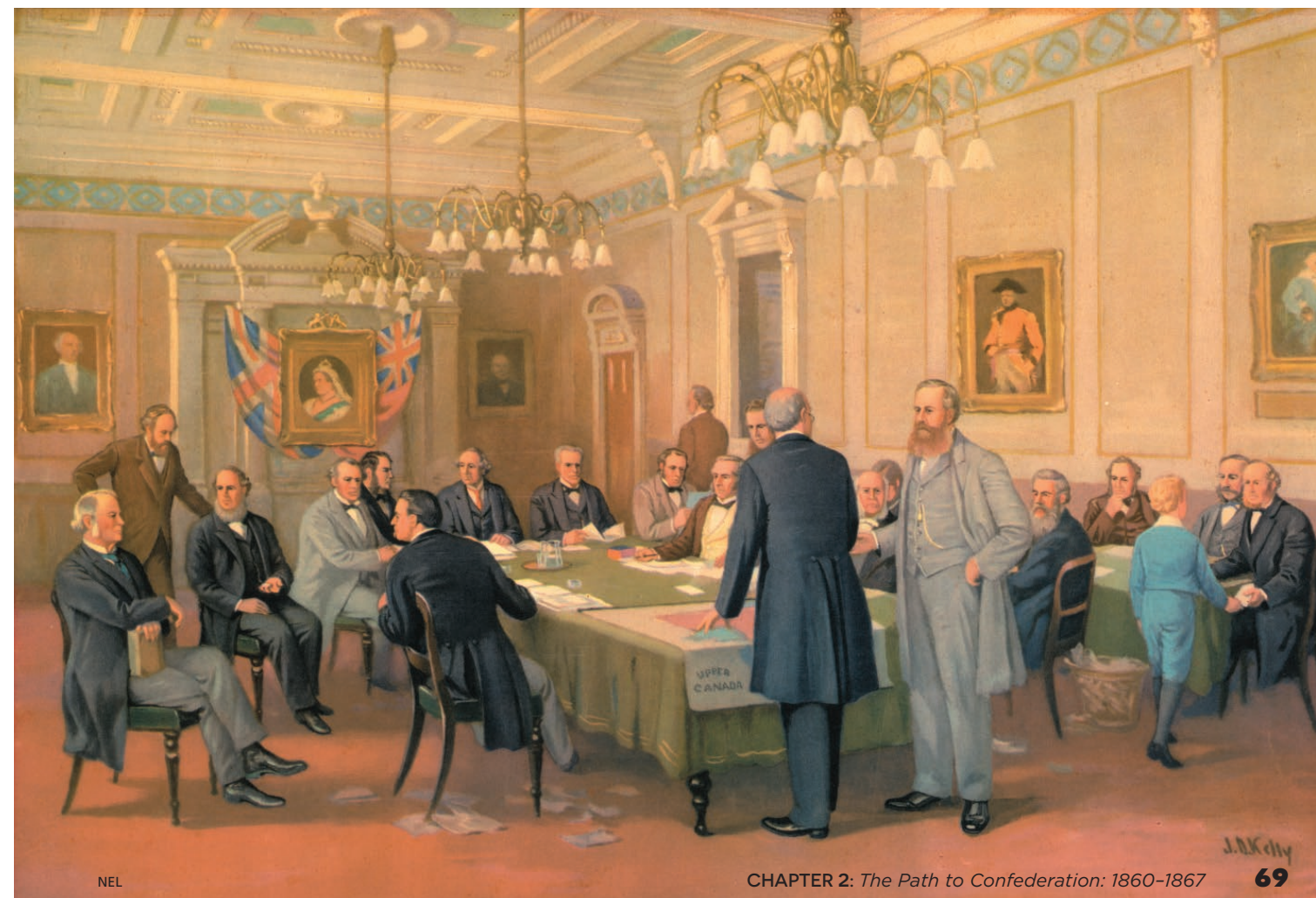
FIGURE 2.30 J.D. Kelly's painting entitled The Fathers of Confederation at the London Conference, 1866 , was reproduced as a colour poster in 1935. Analyze: What do the details of the people, room, and papers suggest about this meeting?