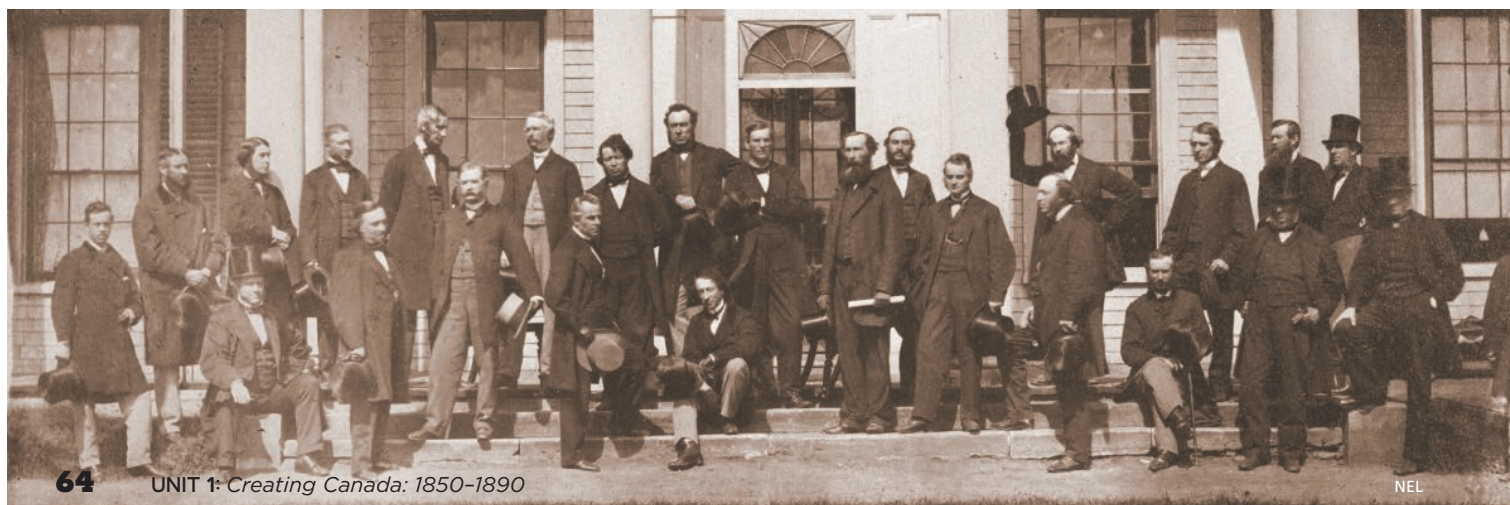
64 UNIT 1: Creating Canada: 1850–1890

Look at the photo in Figure 2.23 . It shows delegates (representatives elected or chosen to act on behalf of others) at the Charlottetown Conference taking a break from the discussions. Compare this photo to the painting in the chapter opener. What similarities and differences do you notice?