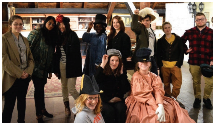
FIGURE 2.31 Members of the Bytown Museum Youth Council

The museum also has a Youth Council (Figure 2.31) made up of 15 members ranging in age from 16 to 23, who learn about and promote Ottawa's history. Through their work, the members become active citizens of their community. For example, they give tours to museum visitors and participate in City of Ottawa events such as Heritage Day and Winterlude. During these events, Youth Council members dress in period costumes and interact with the public.