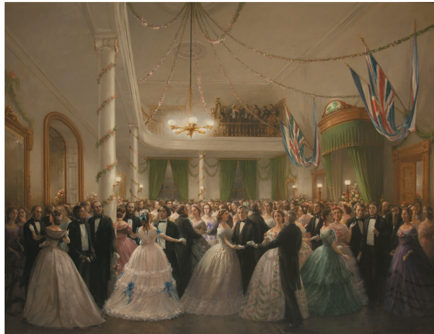
FIGURE 2.24 Dancing at the Charlottetown Province House Ball, 1864 , created by Dusan Kadlec in 1982. Analyze: What message about the role of women is the artist trying to convey in this painting?