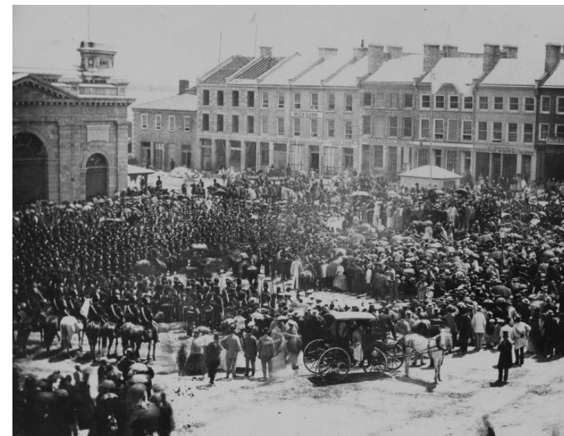
FIGURE 2.32 Market Square, Kingston, Ontario, July 1, 1867. Analyze: What does this photo suggest about the significance of July 1, 1867, to the people of Kingston?

In both Nova Scotia and New Brunswick, Queen Victoria's proclamation met with protests. Many people believed Confederation was pushed on them due to their lack of voting rights. Read Figure 2.34. What other voices may have been missing in the decisions on Confederation?